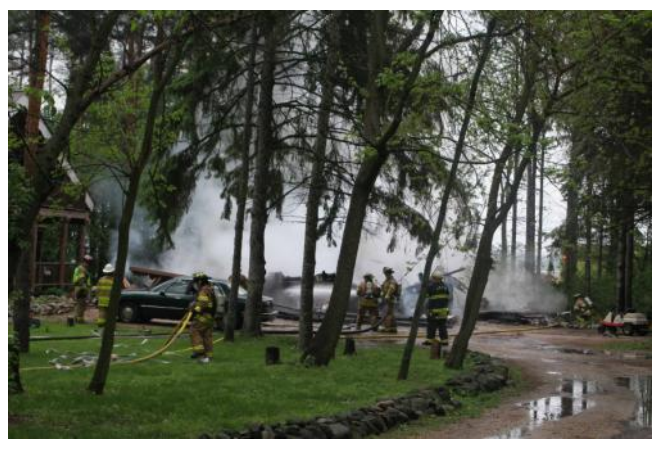
Above & Right: May 27, 2014 - The Dousman Fire District requested Waukesha County Div 106 Box 32-22 to a 2nd alarm level to prevent an adjoining structure from spreading to the house at 35000 Bartlett Road.

Often shown in this newsletter are pictures of the MABAS response to large structure fires. Equally valuable is the ability of MABAS to stop a fire from getting large and causing extensive property damage, as shown in these photos.