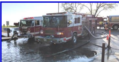
At left: a fill site where engines draft from a water source & fill the tenders.