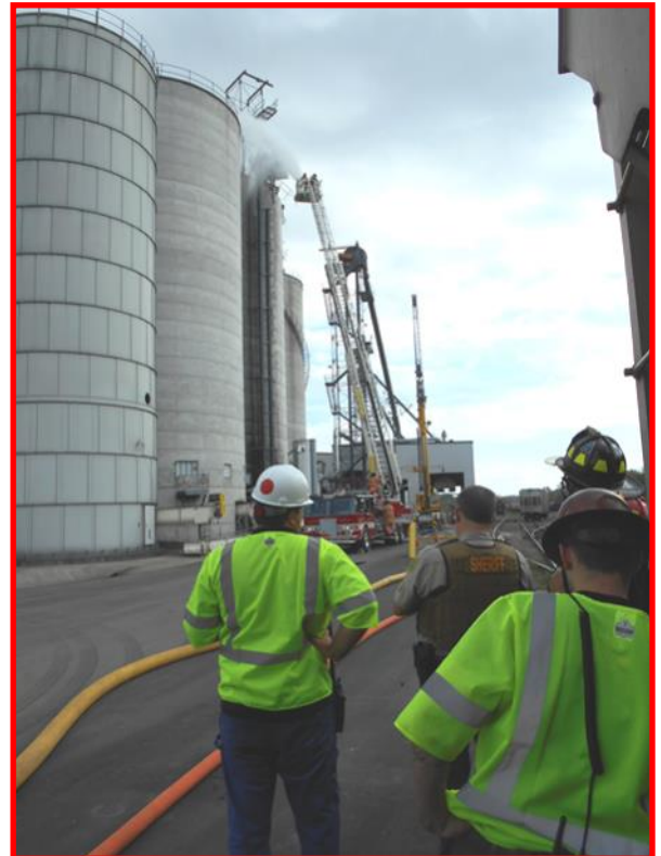
Observation of the incident as fire crews are indirectly placing water on the remaining silo contents with a spray pattern. A crane was also in place at this time to pull off the loose pieces after the explosion.

As much of this preliminary work was being done, it was discussed as to who might need to be involved in the investigation.