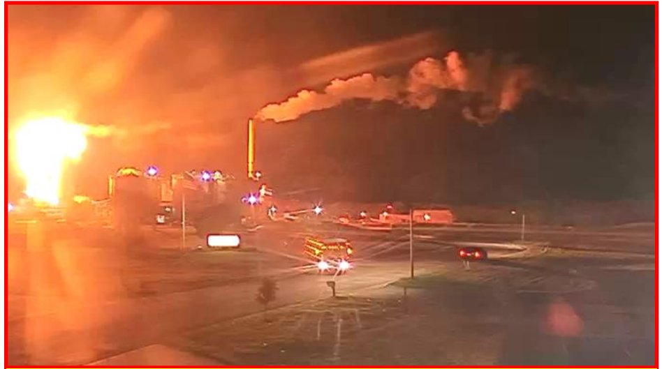
Explosion captured by the firehouse severe weather cam.

Badger State Ethanol (BSE) is a dry-mill ethanol production facility. BSE has the production capacity of over 85 million gallons of ethanol per year. In addition to distilled dried grains with solubles (DDGS), also produced is 50% corn protein (Dry Matter Basis) feed and corn oil. Carbon dioxide is also captured for use in the food industry.