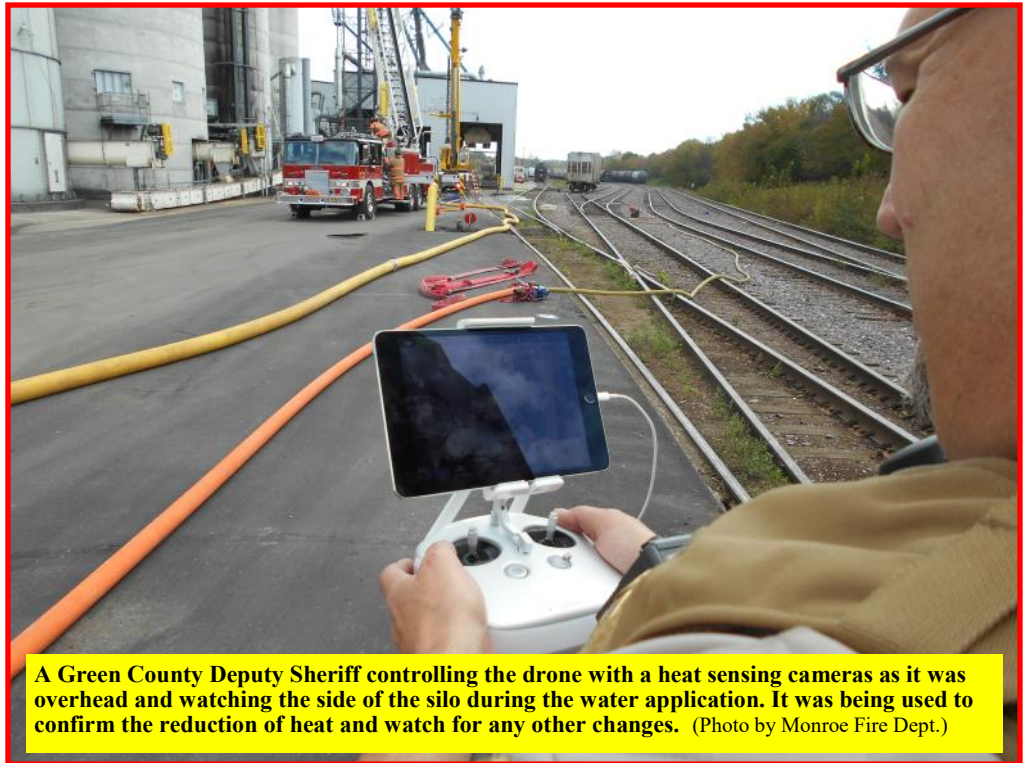
A Green County Deputy Sheriff controlling the drone with a heat sensing cameras as it was overhead and watching the side of the silo during the water application. It was being used to confirm the reduction of heat and watch for any other changes.

This allowed the investigator to quickly see what had happened and get information quickly.