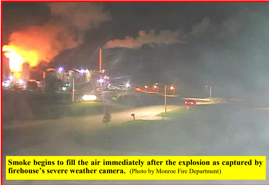
Smoke begins to fill the air immediately after the explosion as captured by firehouse's severe weather camera.

It was decided to invite those agencies that might need to be here for not only investigation of the explosion itself, as well as anyone that could help us identify any mistakes we might be making as we moved forward. This included Wisconsin Emergency Management (WEM), the Wisconsin Department of Justice, Division of Criminal Investigation (DCI), and OSHA.