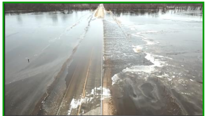
Above: County T near Brodhead.

Several towns and the Green County Highway Department were eligible to apply to the WI Disaster Fund. Damages to roads will exceed to over well over $250,000.00.