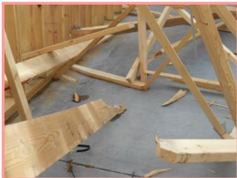
A close-up of trusses that split at the scene of the building collapse.

Subscribe to this newsletter - visit http://mailman.wsfca.com/mailman/listinfo Enter your email address and name and click "subscribe."