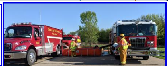
At right: tenders dumping their water & an engine drafting to supply other trucks to extinguish a fire.