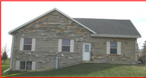
855 Odawa Circle

Due to the high winds and extreme heat, the residence next door to the west at 855 Odawa Circle (#3 exposure) sustained heat damage to the east side of the residence. Although the vinyl siding had melted off of the residence, there was no flame damage to the structure.