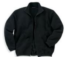
Fleece Zip Jacket