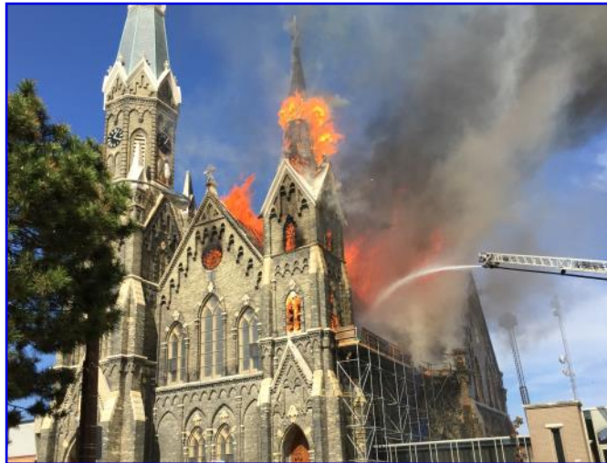
Note the scaffolding on the right

Having been working alongside the 4 th Battalion Chief in our Third Ward area (just south of downtown) evaluating some older high-risk structures, I was inbound quickly.