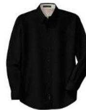
Men's Long Sleeve Dress Shirt