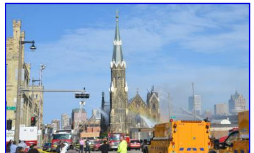
Note the nearby Milwaukee downtown skyline.

I was humbled and proud to watch over one-half of the on-duty Milwaukee Fire Department personnel tackle and control this major fire. They handled already difficult circumstances and evolving and changing positioning concerns with the agility and the can-do attitude of the proven.