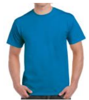
Short Sleeve T-Shirt