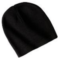
Black Winter Beanie Hat

We always have a limited supply of t-shirts, baseball caps, beanie winter hats, and the POV decals on hand at the conference. There is a discounted rate at the conference because we don't need to cover shipping costs for the items sold at the conference.