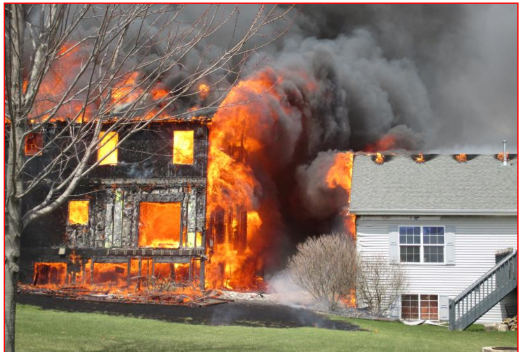
845 & 835 Odawa Circle

I would like to thank them all for a job well done.