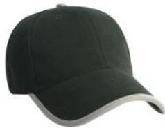
Black Reflective Baseball Cap