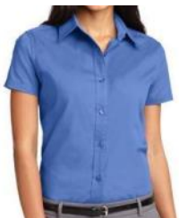
Women's Short Sleeve Dress Shirt