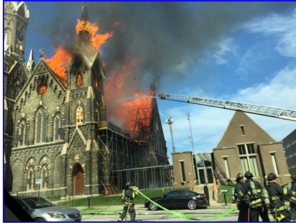
One of the smaller steeples just before inward collapse

After speaking with my City-Wide Incident Safety Officer (Car 18), who was presently assuming the the Incident Commander role, I assumed Command and requested the 3 rd Alarm , establishing Staging around the corner at North 10 th Street & West State Street.