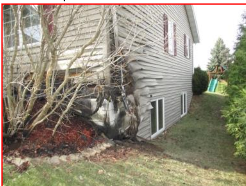
824 Odawa Circle