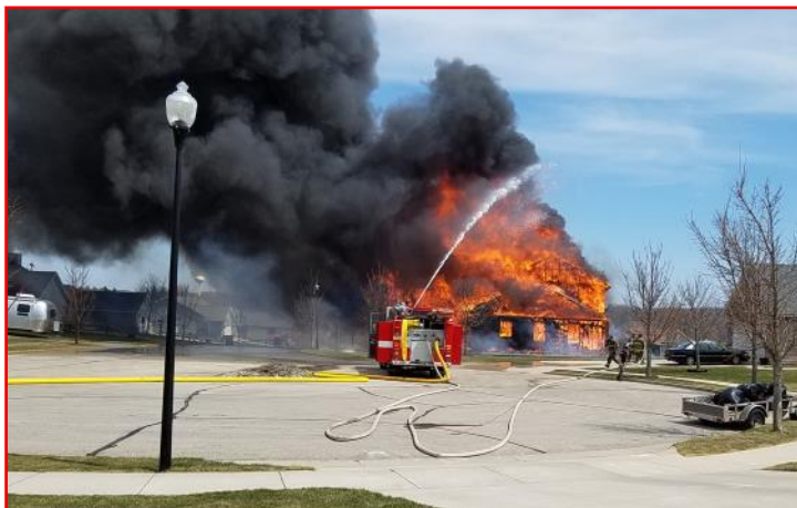
Condition encountered upon arrival

Boltonville Fire Chief arrived on scene and was assigned as the