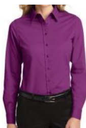
Women's Long Sleeve Dress Shirt