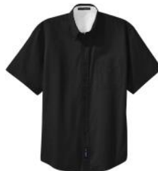
Men's Short Sleeve Dress Shirt