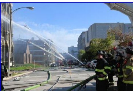
Maintaining the "collapse zone"

While setting up Truck Company 2's tower ladder for aerial master stream operations and conducting a rapid interior primary search of all of the areas of the church and its attached office building, a request for a 2 nd Alarm was transmitted. That brought double the complement of the 1 st Alarm and augmented the Command Staff.