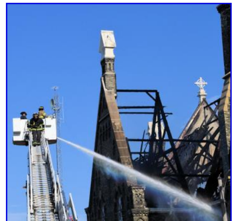
Much of the façade withstood the flames. Miraculously, the congregation intends to rebuild. Milwaukee Area Technical College is the building on the left and provided space for church services.