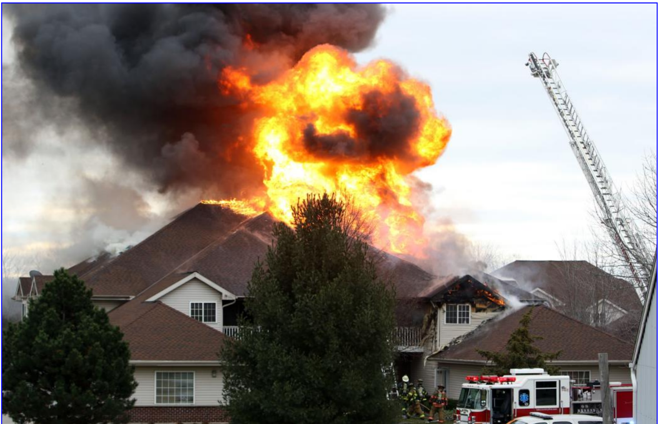
Div 106 in action. See next page.

We did have HUGE radio interference issues on these vessels as they are all steel and transmitting on any type of repeated channel is virtually impossible once you have entered the interior area or below any deck. We did use our fire ground channels which did help but we had to be positioned properly in order for everything to work properly.