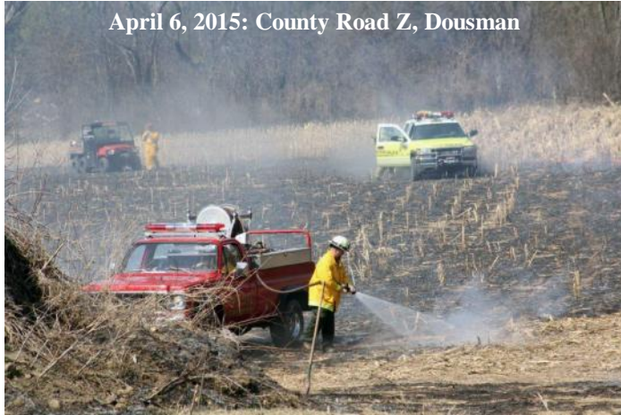
April 6, 2015: County Road Z, Dousman