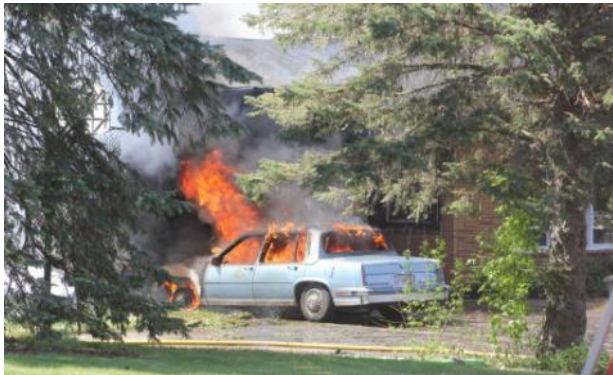
May 23, 2015: Mount Vernon Drive, Pewaukee Car fire spreads to attached garage & house