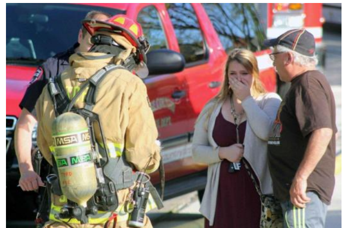
April 9, 2015: Lightning Strike, Genevieve Drive, Mukwonago