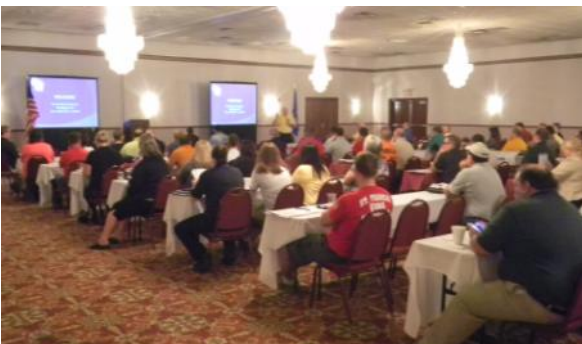
General Session: Largest MABAS Deployment Ever - Echo Foods Fire of Div 102