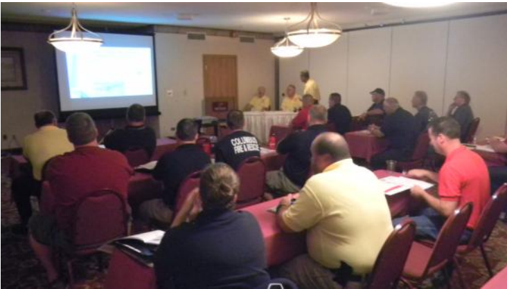
Break-out Session: First Due - When Do I Call For A Box Alarm - Attended by Div 103 108 121 124 135 144 145 147 & Future Division Lincoln County