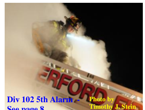
Div 102 5th Alarm See page 8