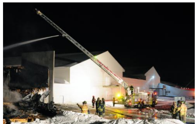
The photo lower right shows similar adjacent structures that were saved. All photos by Timothy J. Stein. These photos are located at www.fyrpix.com in the “Featured Galleries Area”