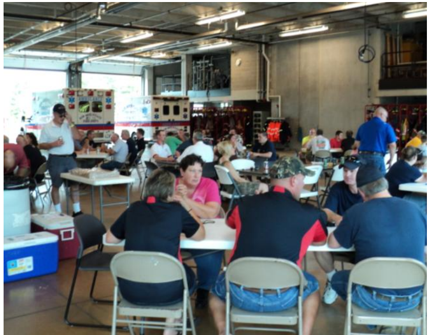
Family Style Picnic Hosted by Rib Mountain Fire-Rescue: A chance to network and socialize with MABAS users from all around Wisconsin