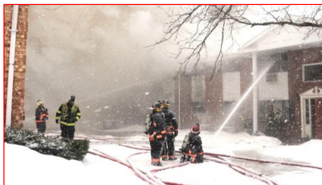
Lower Left: Snow falling during the fire.

The firefighter was OK, but missed falling through a first floor hole to the water-filled basement by 10 feet.