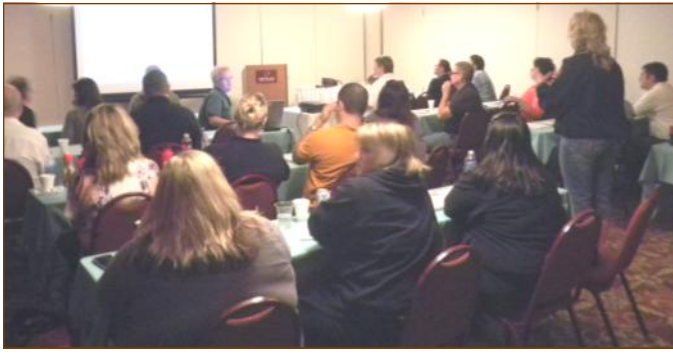
Managing a Dispatch Center - attended by Divisions 102 103 113 115 120 124 127 130 134 135 137 140 141 147