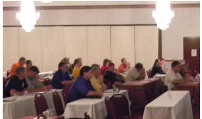
Break-out Session: ABC's of Box Card Development - Attended by Div 102 103 104 114 116 118 120 127 130 134 138 141 142 & Future Division Crawford County