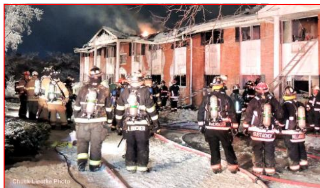
Lower Right: Snow storm ended but fire raged on.