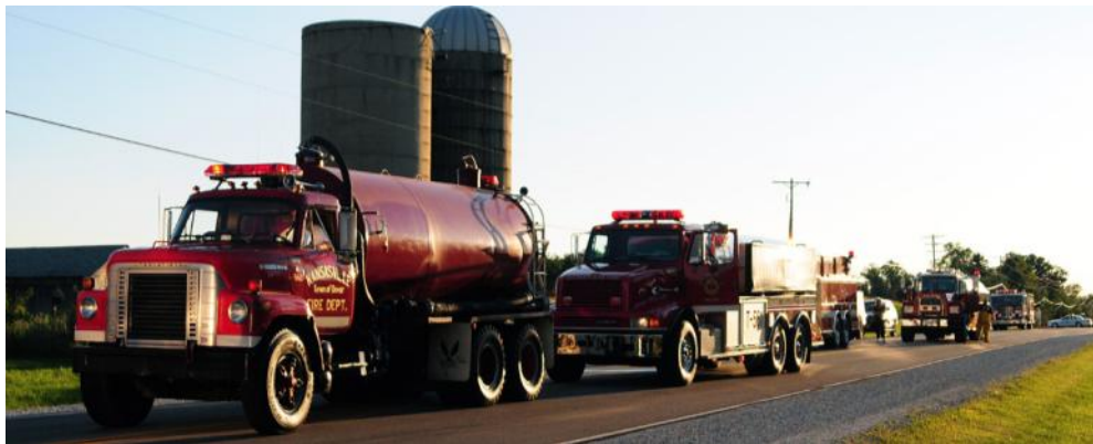
Water tenders in operation at Town of Paris MABAS Box