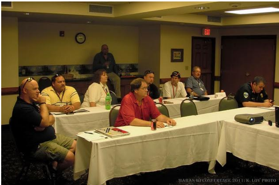
Box Card Development breakout session

This was held over a three day period (August 26-28) in Minocqua.