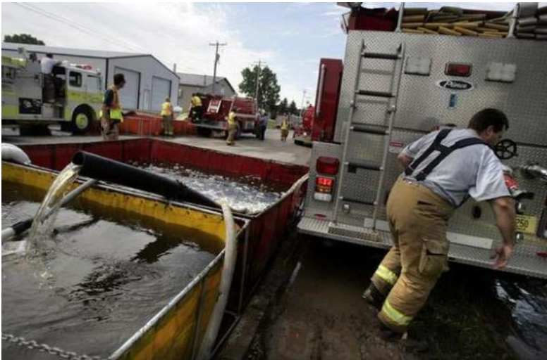
Tender operations at Hilbert mill fire

The hydrant system did not have the capacity for a fire of this magnitude and water was shuttled by tenders from three rural fill sites, two sites were near the Village of Hilbert and the third was in the village of Potter five miles away from the Manitowoc River. It was estimated that overhaul was needed on over 7,000 large bales of hay.