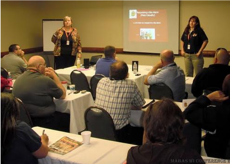
Communications That Occur When Requesting a MABAS Box