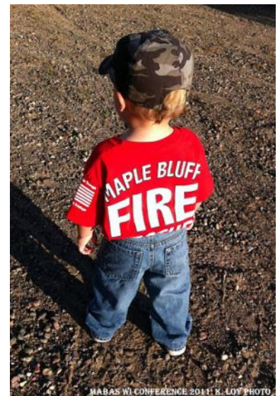
The older we get, the younger the new recruits seem to look!