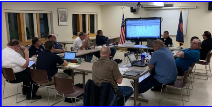
Wisconsin Divisions 101, 102, 103 and Illinois Division 4 annual Box Cards Review.

MABAS Wisconsin Divisions 101 (Kenosha), 102 (Racine), 103 (Walworth) and MABAS Illinois Division 4 (Lake) meet once a year to discuss topics in the area.