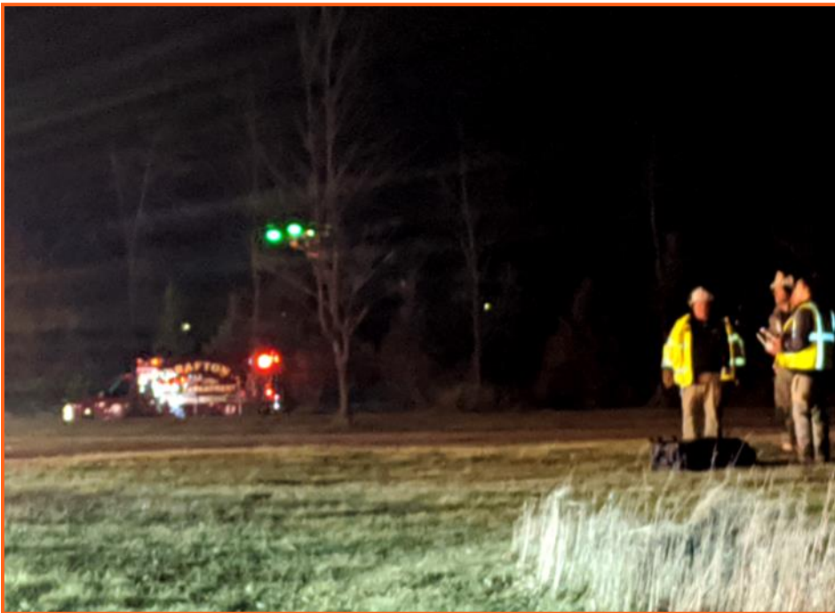
Drone Use: the green lights mark the drone as it lands under the control of Scott Ziegler (EM), a Jackson Fire Chief, and Sheriff's Office personnel. The initial flight was to assist command looking for hot spots in the structure to direct firefighters to those areas for a closer hands-on search and overhaul. A second flight, after daylight, was to assist investigator with scene documentation and close inspection of some areas not easily accessible due to debris and stability concerns.

Given the charging times and the flight time restrictions on batteries, it is important for the pilots and Command to have a clear understanding of the mission needs so it can be flown as efficiently as possible to maximize the flight time.