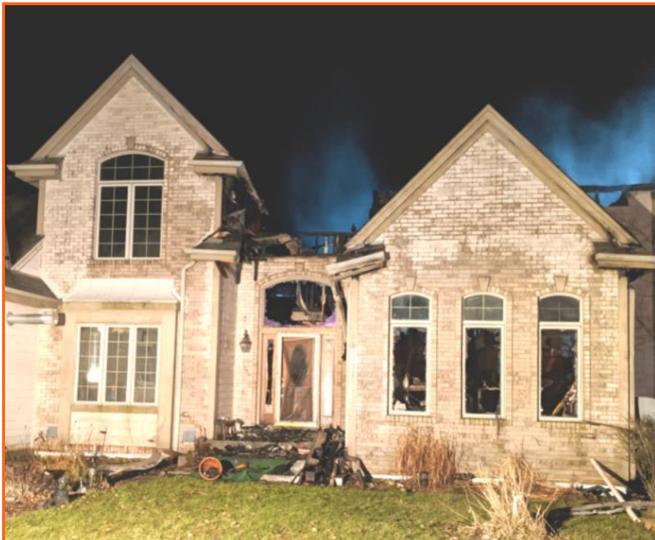
The house had some brick veneer, but otherwise was of lightweight wood frame that provided for quick fire-spread and destruction.