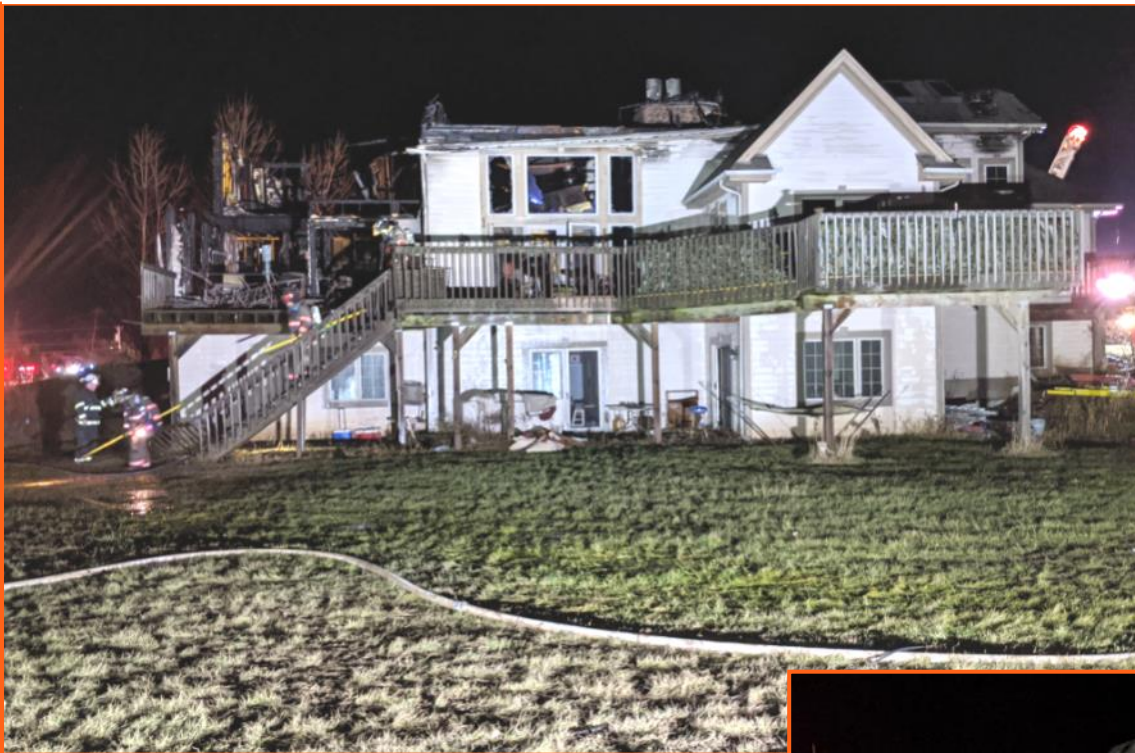
Top Left: upper left corner of the rear (C-Side) of the house where the fire started. Portable lighting was needed for visibility in the pitch black darkness.